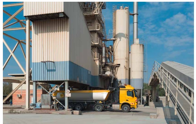
The thermally insulated tipping saddle in use.