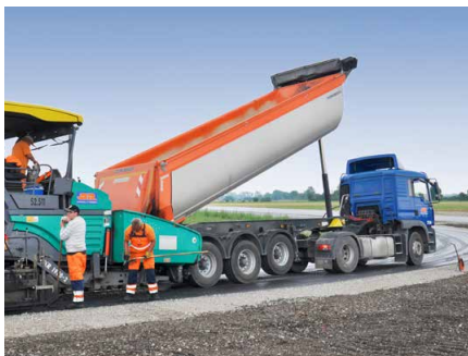
The MEILLER insulation concept ensures consistently high temperatures of the mix.